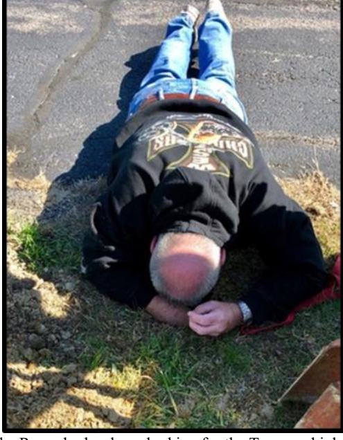
The Recorder has been looking for the Treasure high and low and has finally found him.