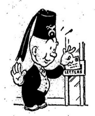
Mail in a petition